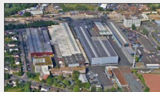
SMS group GmbH, Mönchengladbach (Germany)

SMS group is a world leader in heavy machinery and plant engineering for the steel and metals industry. SMS group companies provide solutions in areas such as continuous casting technology, long products plants, tube and pipe plants, forging plants, nonferrous metals plants, and heat treatment technology in steel plants. The minimill in Hidd has been built by SMS group and SMS Concast.