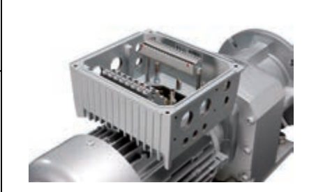
Motor mounted version

All components are installed in the connection unit using the enclosed M4 hexagon socket screw and the washer.