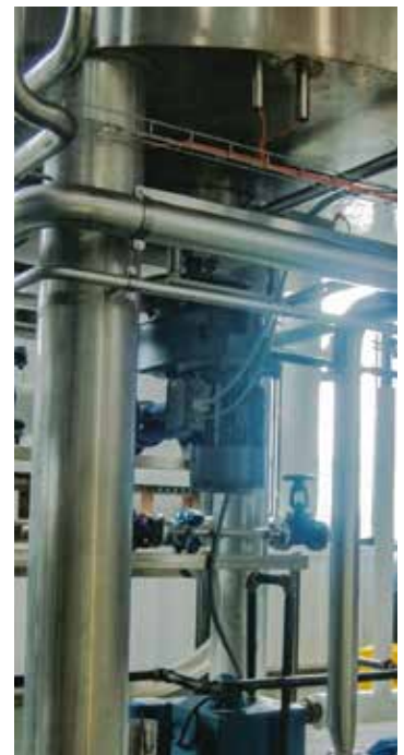
A 5 hp Parallel mounted CLINCHER™ powers the rake in the Mash Tun.

NORD has expanded its motor portfolio to include smooth surface motors in order to provide a cost-effective, light-weight and easy to clean solution ideal for the beverage industry and other applications where sanitation and cleanliness are essential.