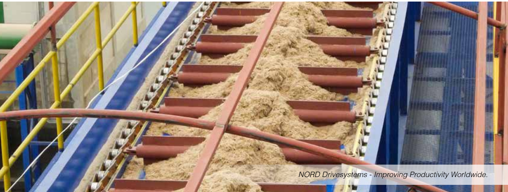
NORD Drivesystems - Improving Productivity Worldwide.