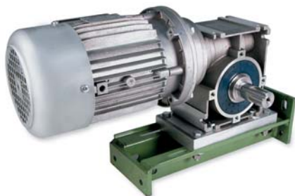
Flexbloc® gearmotor unit, with riser block designed by Famous Footwear

resulting in direct cost savings, less installation time and saved space," reports Roger, almost a year later.