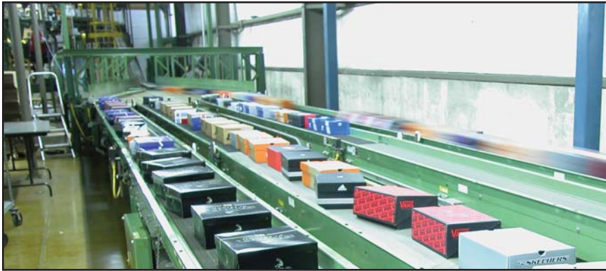
Shoebboxes waiting to be sorted at Sun Prairie, WI facility.

unnecessary. It could be mounted on either side, right-side-up, upside-down or off-the-face. Additionally, one NORD unit would be able to replace two separate sizes of the old. "By switching to FLEXBLOC® units, we functionally replaced four gearboxes with one,